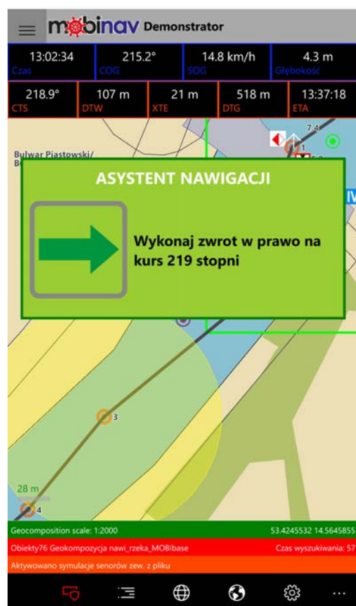
Figure 2. Exaple message of voyage assistant

It can be said that voyage assistant was found as a useful tool and that the concept of mixing car navigation technology into water navigation system was a good idea. Additionally comparing to Inland